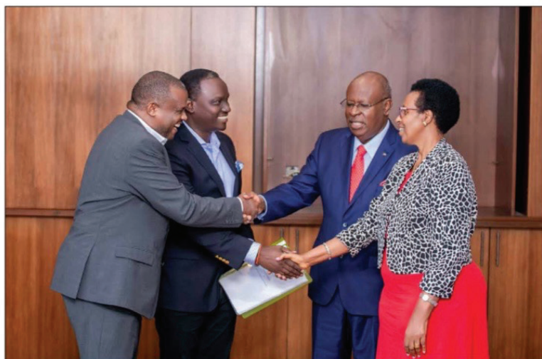
SIGNING OF THE IGONGO-NILE HOTEL AGREEMENT