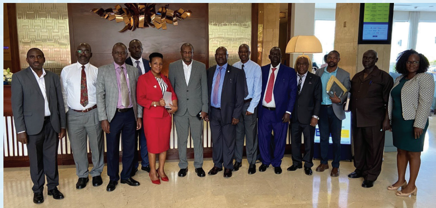
Yumbe technical staff getting training from Soroti fruit factory